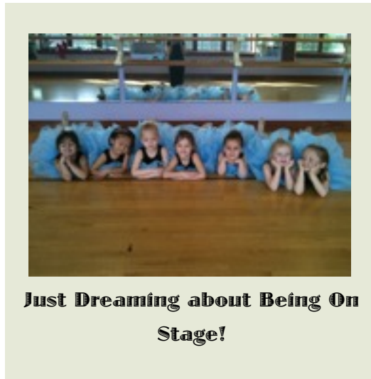
Just Dreaming about Being On Stage!

Just a few reminders. . . Please have your dancer visit the restroom before entering the studio. Please have them leave gum, long earrings, and street shoes outside the studio. Please remind them to be respectful of others